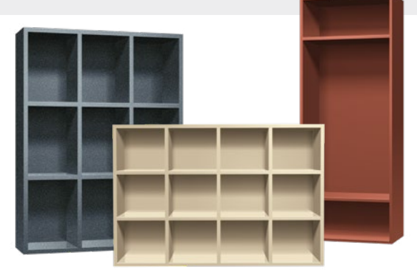
No painting ever required.