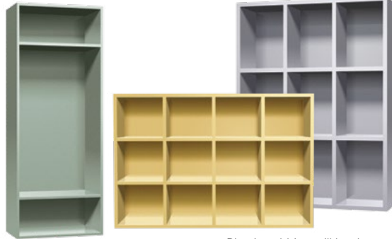
Plastic cubbies will be the same color throughout.

Plastic Traditional Plus Collection Lockers shown in Blue #9505 with lattice ventilation on double-tier locker and standard slotted ventilation on others.